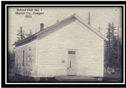
1 st Schoolhouse 1853