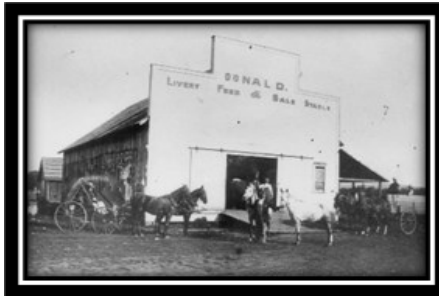
Donald Livery, Feed & Sales Stable