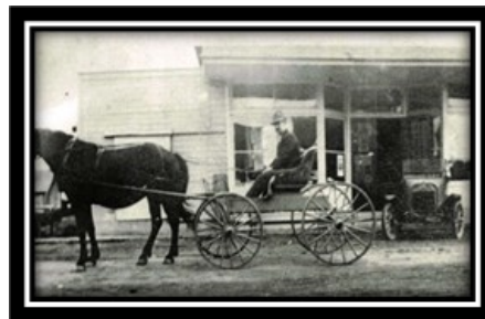
Martyr, Carver & Groff store (now Donald Tavern)