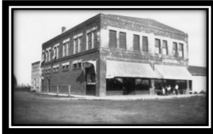
Hoskins and DeSart building (now the Center Market)